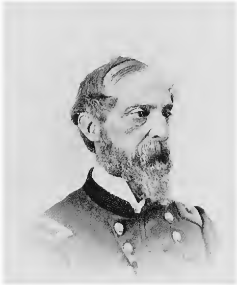
GENERAL GEORGE G. MEADE